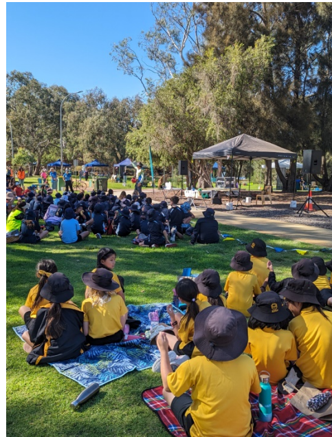
Photo: Students listening to Captain Cleanup at the start of the day.

There were 14 classes (354 children) and the evaluation positive. “Love the many hands on activities, especially when the chn get to take the end product home.”