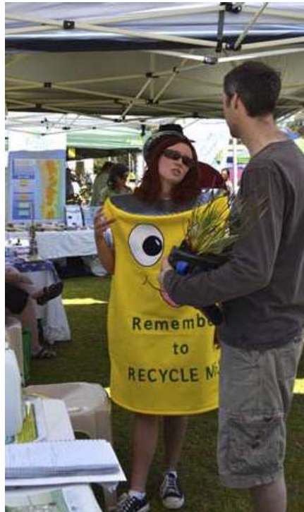
'Sam the Can' engaging with a visitor about waste issues

On the day, initiatives were implemented to support the low-waste expo. A two-bin system was introduced to encourage people to separate their waste and recyclables according to the signage