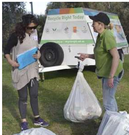
Weighing and auditing labelled bin bags

provided, and were lined to allow for auditing at the end of the expo.